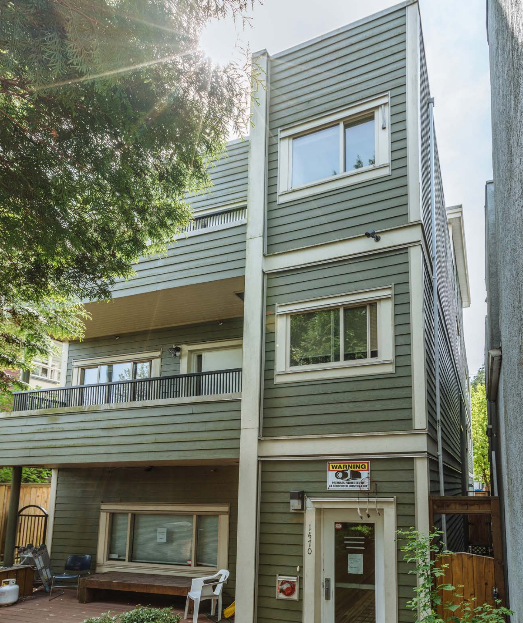
Circle of Eagles Lodge for Men