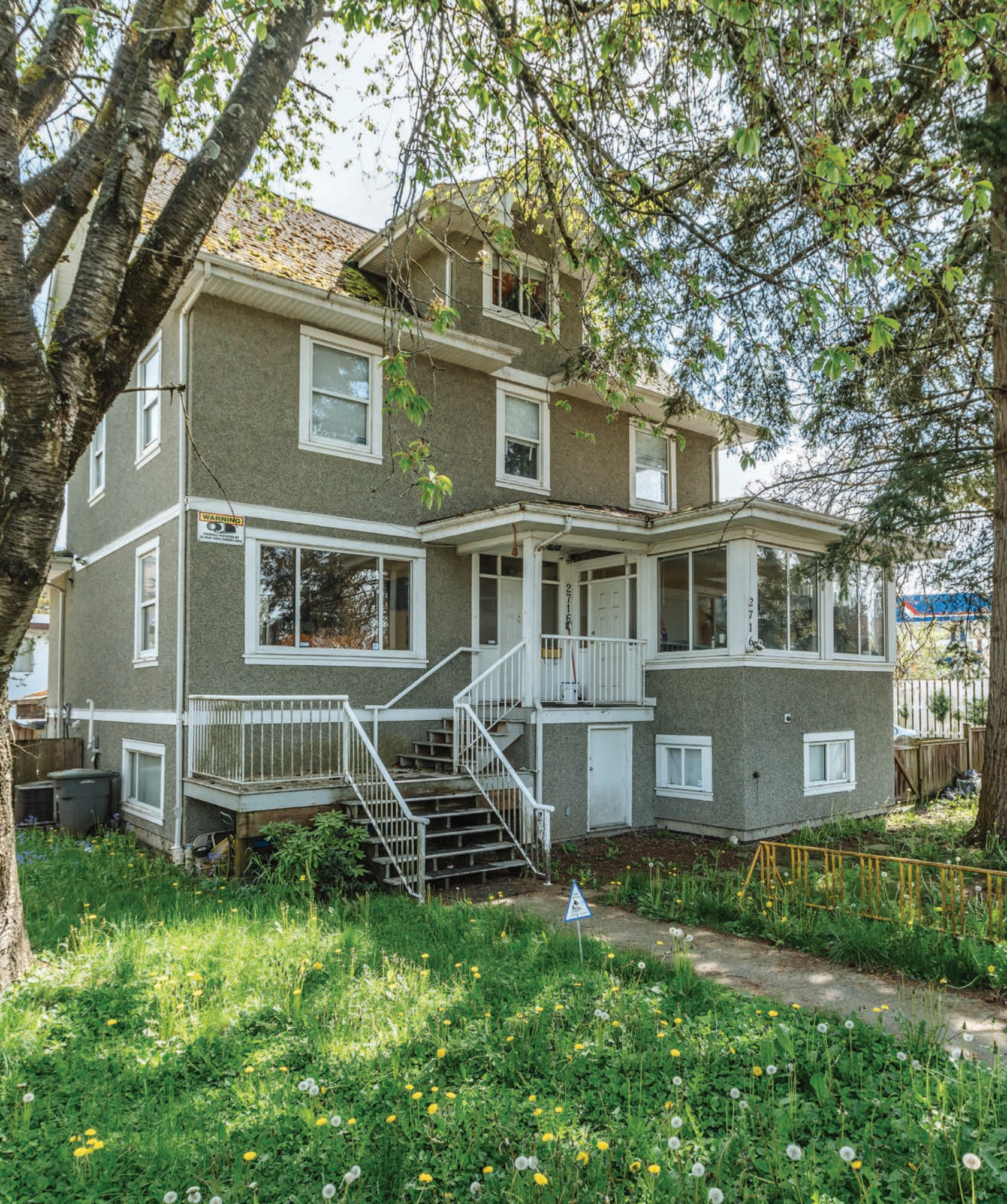
Anderson Lodge Healing Center for Women